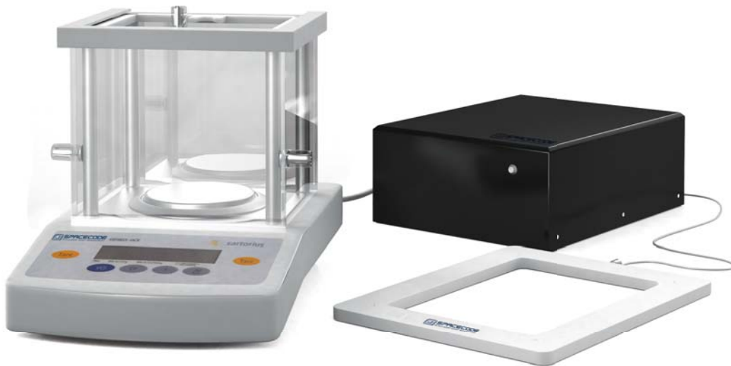
RFID Reader Box Black Plastic Casing Black Coated Aluminium Base